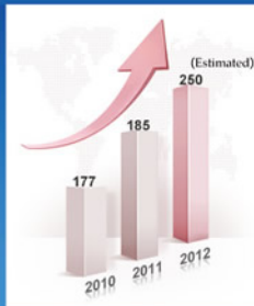
Visitor number growth (2010-2012)